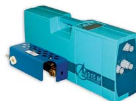
RA-915M with RP-91C