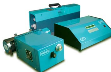
RA-915M with PYRO-915+