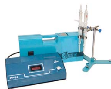
RA-915M with RP-92